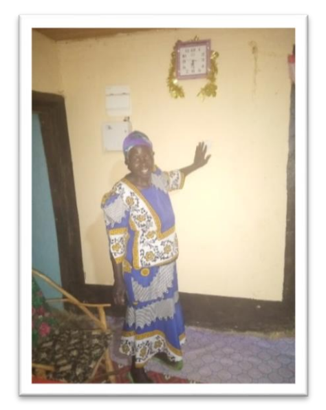
The Bible says that if you give a man a fish, he will eat today, but teach a man to fish and he will eat forever.